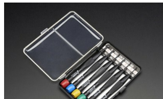
Precision screwdriver set (6)