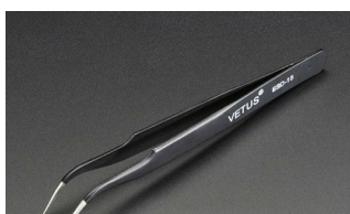
Fine tip curved tweezers -