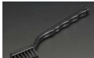
ESD-Safe PCB Cleaning