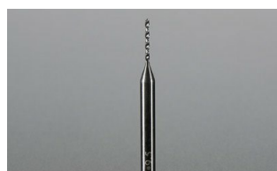
Carbide PCB Drill Bit -