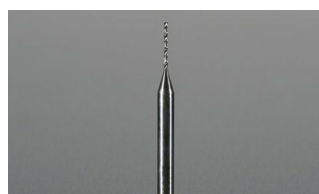
Carbide Square End Mill -