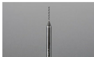
Carbide PCB Drill Bit -