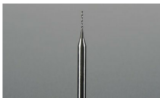
Carbide Square End Mill -