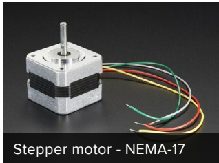
Stepper motor - NEMA-17