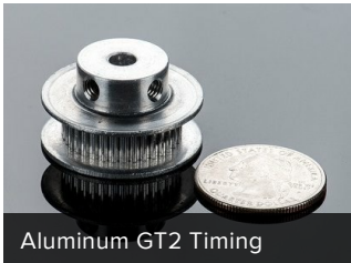
Aluminum GT2 Timing