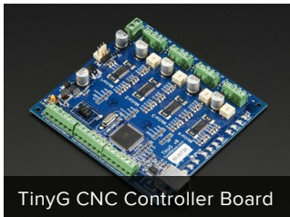
TinyG CNC Controller Board