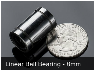
Linear Ball Bearing - 8mm