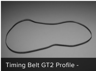
Timing Belt GT2 Profile -