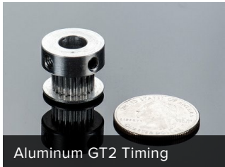
Aluminum GT2 Timing