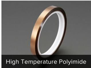
High Temperature Polyimide