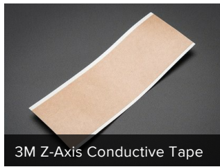
3M Z-Axis Conductive Tape