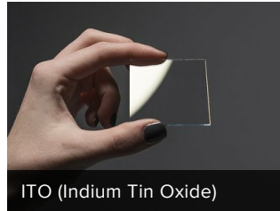
ITO (Indium Tin Oxide)