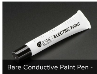
Bare Conductive Paint Pen -