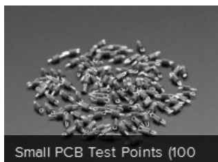
Small PCB Test Points (100