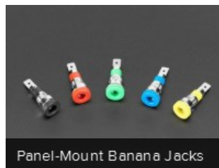
Panel-Mount Banana Jacks