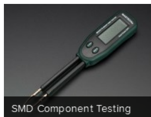
SMD Component Testing