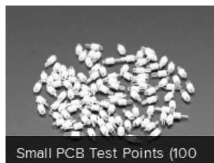
Small PCB Test Points (100