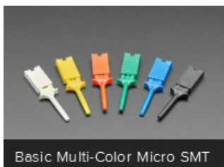
Basic Multi-Color Micro SMT