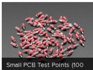
Small PCB Test Points (100