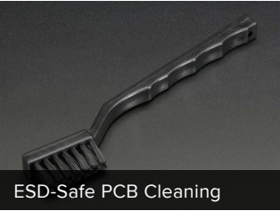
ESD-Safe PCB Cleaning