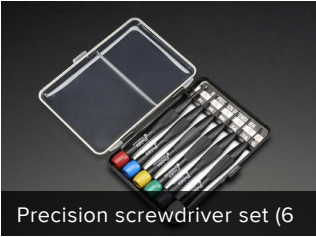
Precision screwdriver set (6