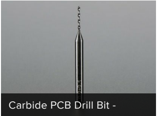
Carbide PCB Drill Bit -