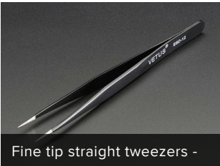
Fine tip straight tweezers -