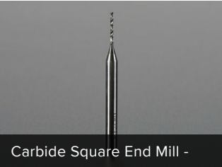
Carbide Square End Mill -