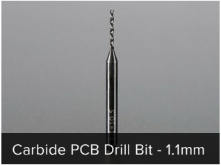
Carbide PCB Drill Bit - 1.1mm