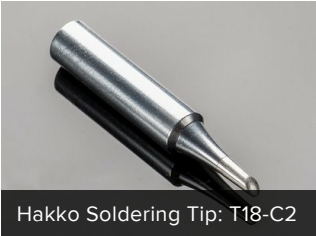
Hakko Soldering Tip: T18-C2