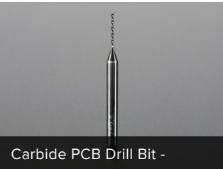
Carbide PCB Drill Bit -