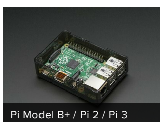
Pi Model B+ / Pi 2 / Pi 3