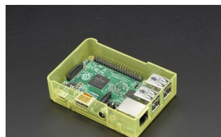
Pi Model B+ / Pi 2 / Pi 3