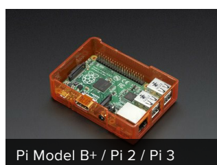
Pi Model B+ / Pi 2 / Pi 3