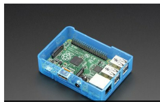
Pi Model B+ / Pi 2 / Pi 3