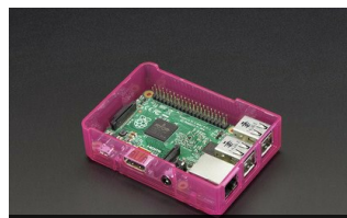
Pi Model B+ / Pi 2 / Pi 3