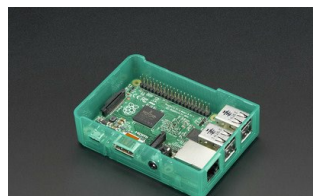
Pi Model B+ / Pi 2 / Pi 3