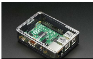
Adafruit Raspberry Pi B+ / Pi 3