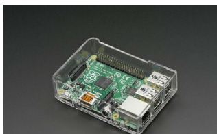
Pi Model B+ / Pi 2 / Pi 3