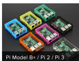
Pi Model B+ / Pi 2 / Pi 3