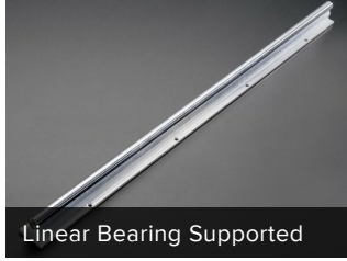
Linear Bearing Supported