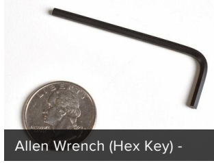
Allen Wrench (Hex Key) -