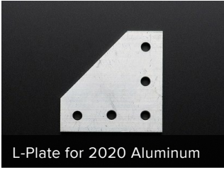
L-Plate for 2020 Aluminum