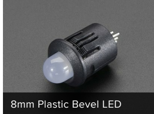
8mm Plastic Bevel LED