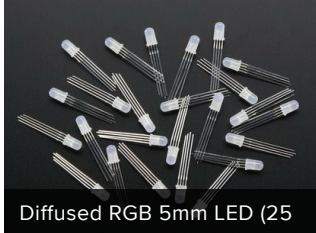
Diffused RGB 5mm LED (25)