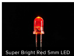
Super Bright Red 5mm LED