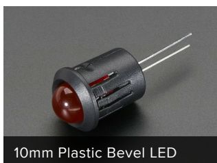
10mm Plastic Bevel LED