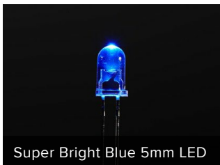
Super Bright Blue 5mm LED