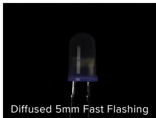
Diffused 5mm Fast Flashing