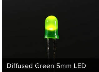
Diffused Green 5mm LED