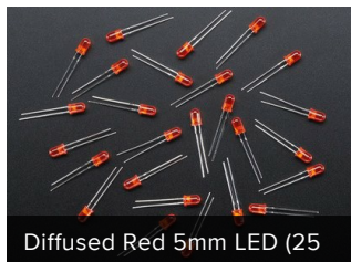
Diffused Red 5mm LED (25)