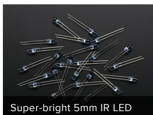
Super-bright 5mm IR LED