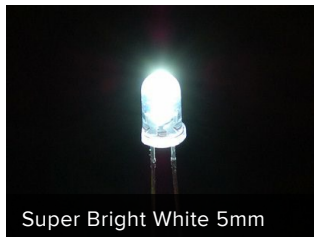
Super Bright White 5mm