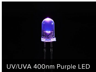
UV/UVA 400nm Purple LED