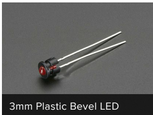
3mm Plastic Bevel LED