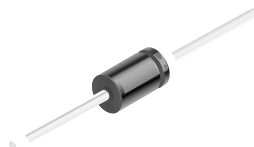
DO-35 Glass case COLOR BAND DENOTES CATHODE