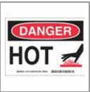
DANGER Hot Sign