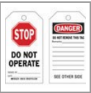
DANGER Hot Sign