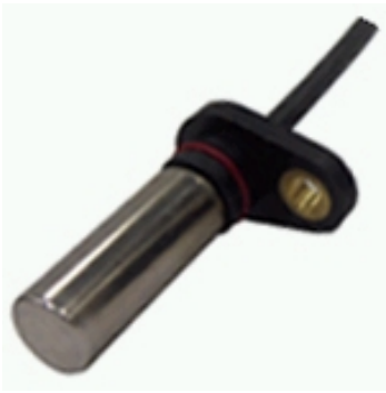
Actual product appearance may vary.

Home> Products > Speed and Direction> SNDH> Product Page