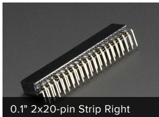
0.1" 2x20-pin Strip Right