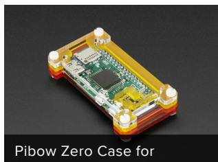
Pibow Zero Case for