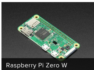
Raspberry Pi Zero W