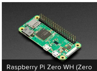
Raspberry Pi Zero WH (Zero)