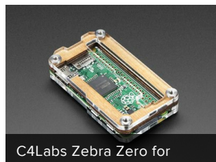
C4Labs Zebra Zero for