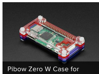
Pibow Zero W Case for