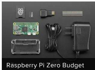
Raspberry Pi Zero Budget