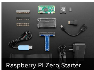
Raspberry Pi Zero Starter