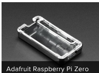
Adafruit Raspberry Pi Zero