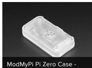
ModMyPi Pi Zero Case -