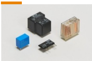
Power Relays (109)