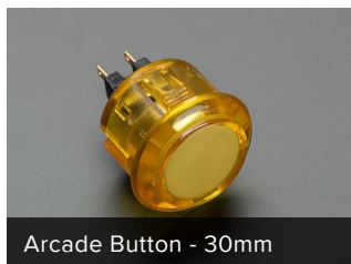
Arcade Button - 30mm