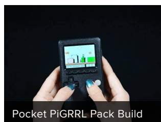
Pocket PiGRRL Pack Build