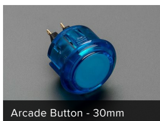
Arcade Button - 30mm