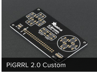
PiGRRL 2.0 Custom