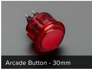
Arcade Button - 30mm