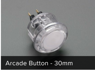
Arcade Button - 30mm