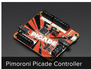
Pimoroni Picade Controller