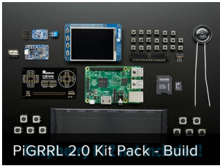
PiGRRL 2.0 Kit Pack + Build