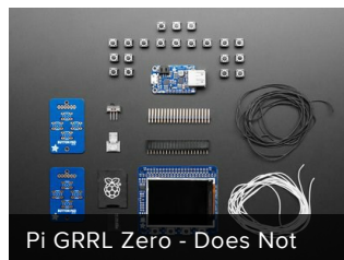
Pi GRRL Zero - Does Not