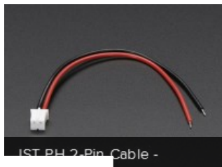
JST PH 2-Pin Cable - Female