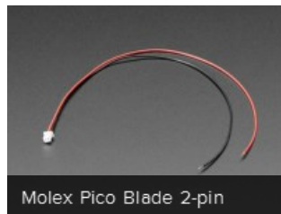
Molex Pico Blade 2-pin