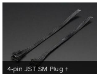
4-pin JST SM Plug +