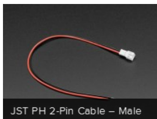
JST PH 2-Pin Cable - Male