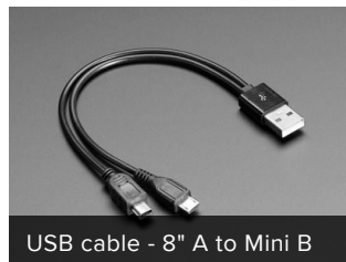
USB cable - 8" A to Mini B