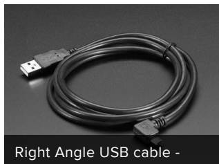
Right Angle USB cable -