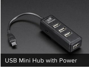
USB Mini Hub with Power