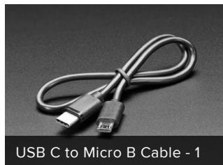
USB C to Micro B Cable - 1