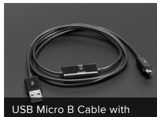
USB Micro B Cable with