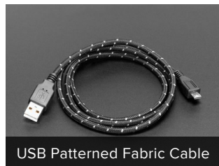
USB Patterned Fabric Cable