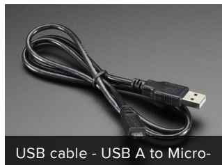
USB cable - USB A to Micro-