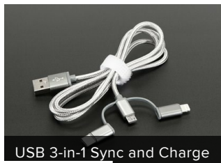
USB 3-in-1 Sync and Charge