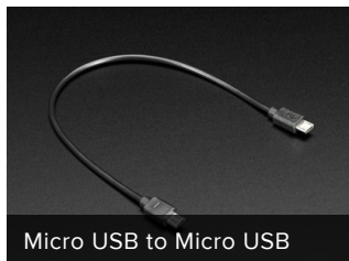
Micro USB to Micro USB