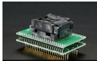
SMT Test Socket - TQFP-48