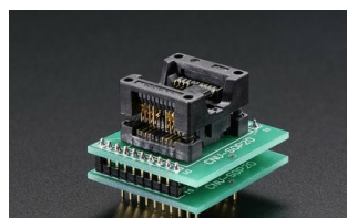
SMT Test Socket - Medium