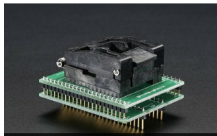
SMT Test Socket - TQFP-44