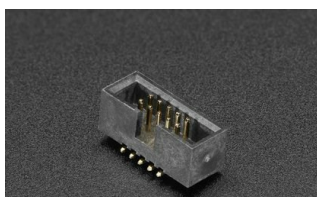
SWD 0.05" Pitch Connector