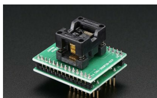
SMT Test Socket - TSSOP-16